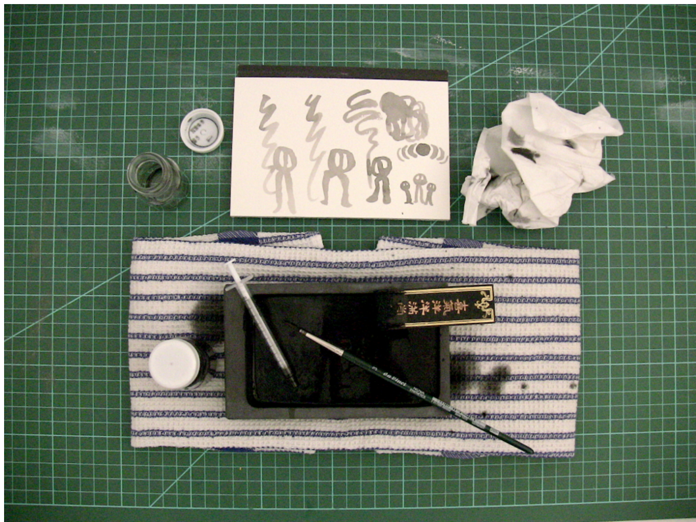
preparing the ink